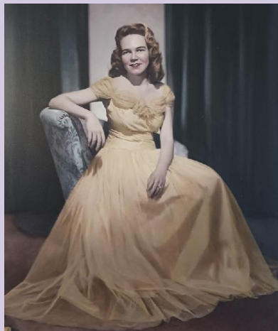
Formal picture at age 22