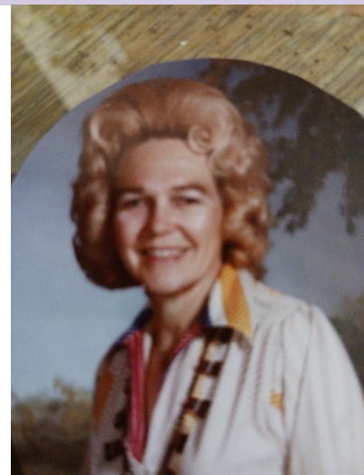
teaching and middle-aged